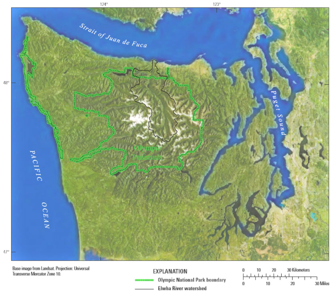
Fig. 2. Map of the Elwha Watershed and Olympic National Park.